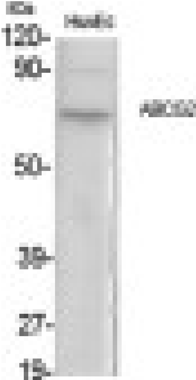
Western blot analysis of ABCG2 in various lysates using ABCG2 antibody.