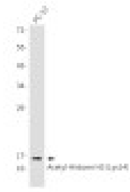
Western blot analysis of Acetyl-Histone H3 (Lys14) in A549, HL-60 lysates using Acetyl-Histone H3 (Lys14) antibody