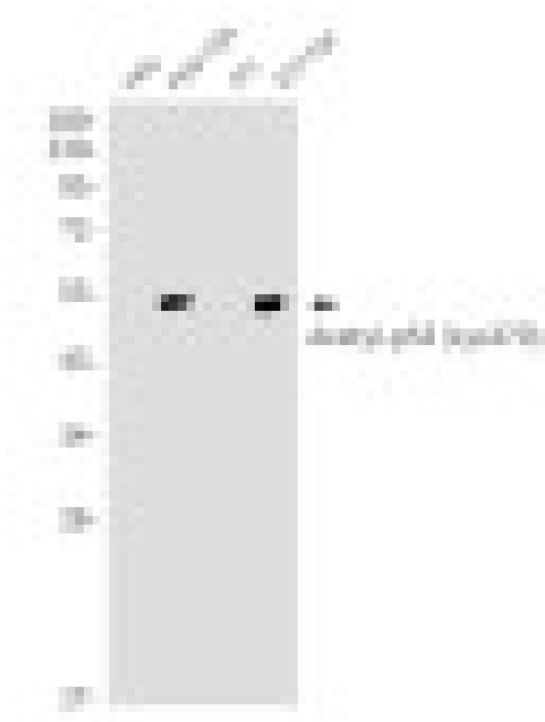
Western blot analysis of Acetyl-p53 (Lys370) in rat Brain lysates using Acetyl-p53 (Lys370) antibody