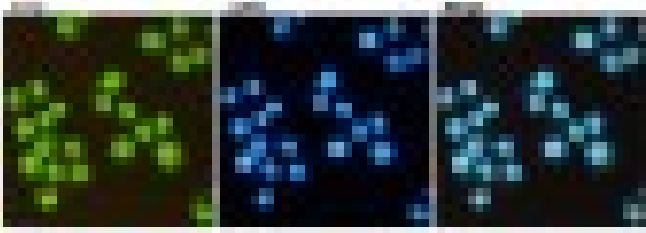
Immunocytochemistry analysis of DiMethyl-Histone H3 (Lys27) in HeLa cells using DiMethyl-Histone H3 (Lys27) (5F6) antibody.