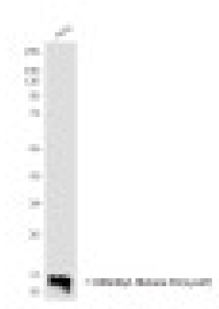
Western blot analysis of DiMethyl-Histone H3 (Lys27) (5F6) in HeLa, rat heart, mouse heart, HUVEC, Jurkat lysates using DiMethyl-Histone H3 (Lys27) (5F6) antibody.